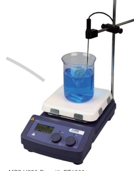
MS7-H550-Pro with PT1000 sensor & support rod/clamp