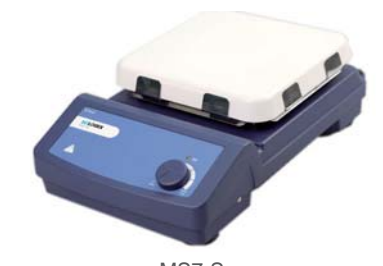
MS7-S Analog magnetic stirrer

PC can control and document all measuring values via RS232 interface.