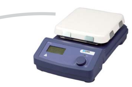
MS7-Pro LCD digital stirrer